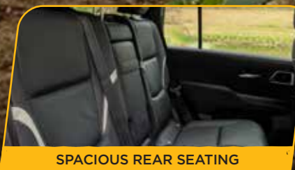
SPACIOUS REAR SEATING