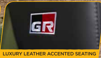
LUXURY LEATHER ACCENTED SEATING