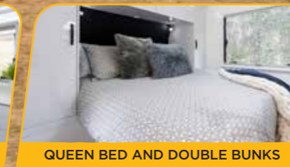
QUEEN BED AND DOUBLE BUNKS