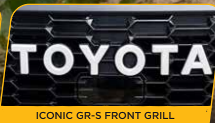
ICONIC GR-S FRONT GRILL