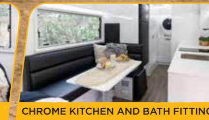
CHROME KITCHEN AND BATH FITTINGS