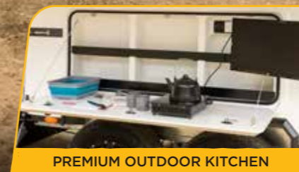
PREMIUM OUTDOOR KITCHEN