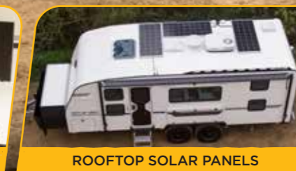
ROOFTOP SOLAR PANELS