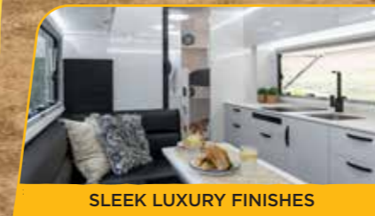
SLEEK LUXURY FINISHES