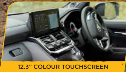
12.3" COLOUR TOUCHSCREEN