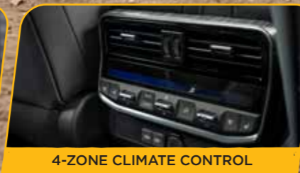
4-ZONE CLIMATE CONTROL