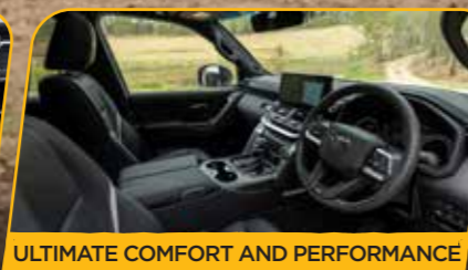
ULTIMATE COMFORT AND PERFORMANCE