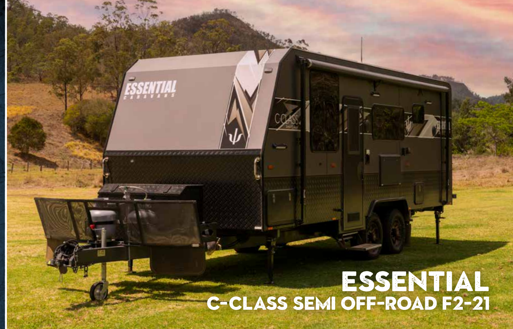
ESSENTIAL C-CLASS SEMI OFF-ROAD F2-21