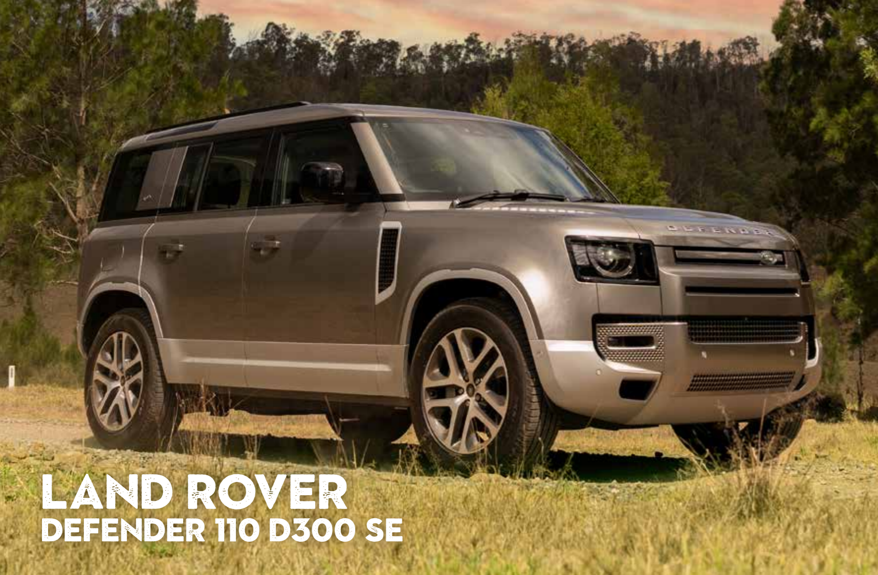
LAND ROVER DEFENDER 110 D300 SE