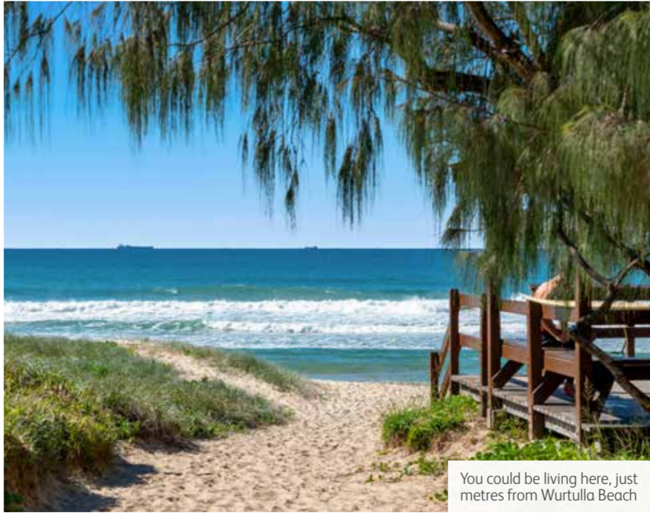
You could be living here, just metres from Wurtulla Beach

Estimated rental return: Furnished: $104,000 p/annum Unfurnished: $93,600 p/annum