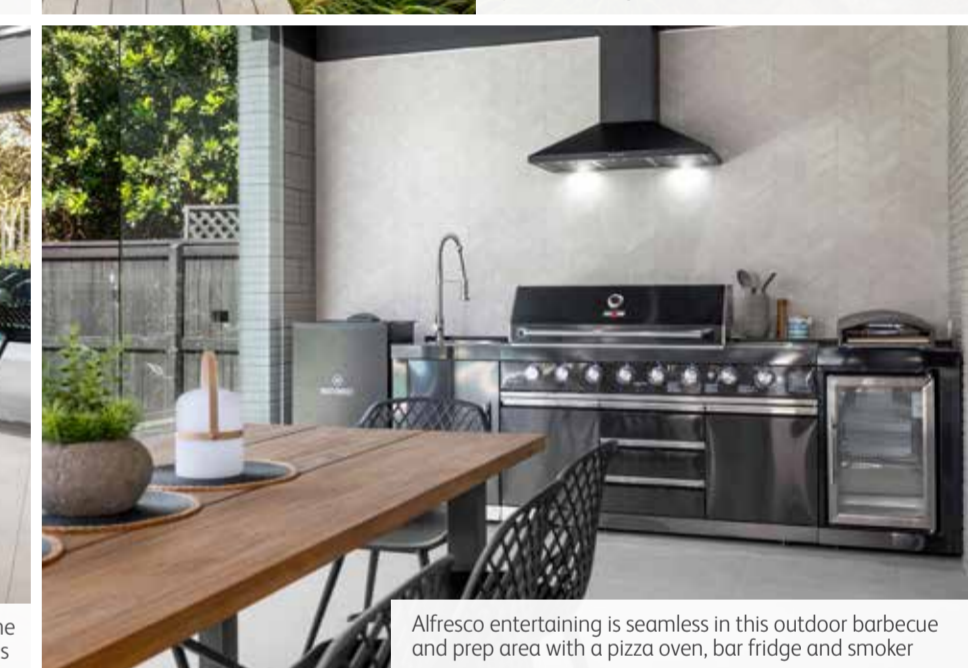
Alfresco entertaining is seamless in this outdoor barbecue and prep area with a pizza oven, bar fridge and smoker

413 OCEANIC DRIVE SOUTH, WURTULLA, SUNSHINE COAST