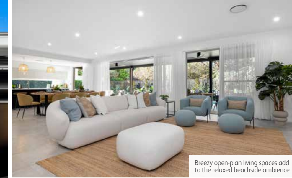
Breezy open-plan living spaces add to the relaxed beachside ambience