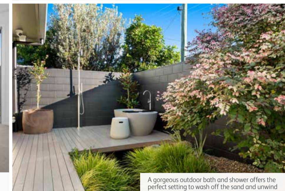
A gorgeous outdoor bath and shower offers the perfect setting to wash off the sand and unwind