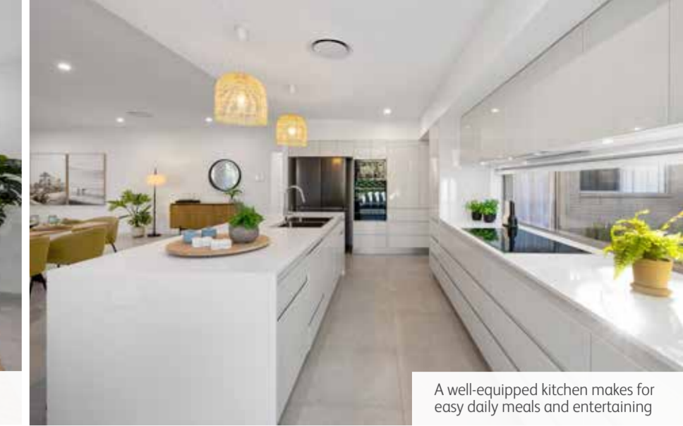
A well-equipped kitchen makes for easy daily meals and entertaining