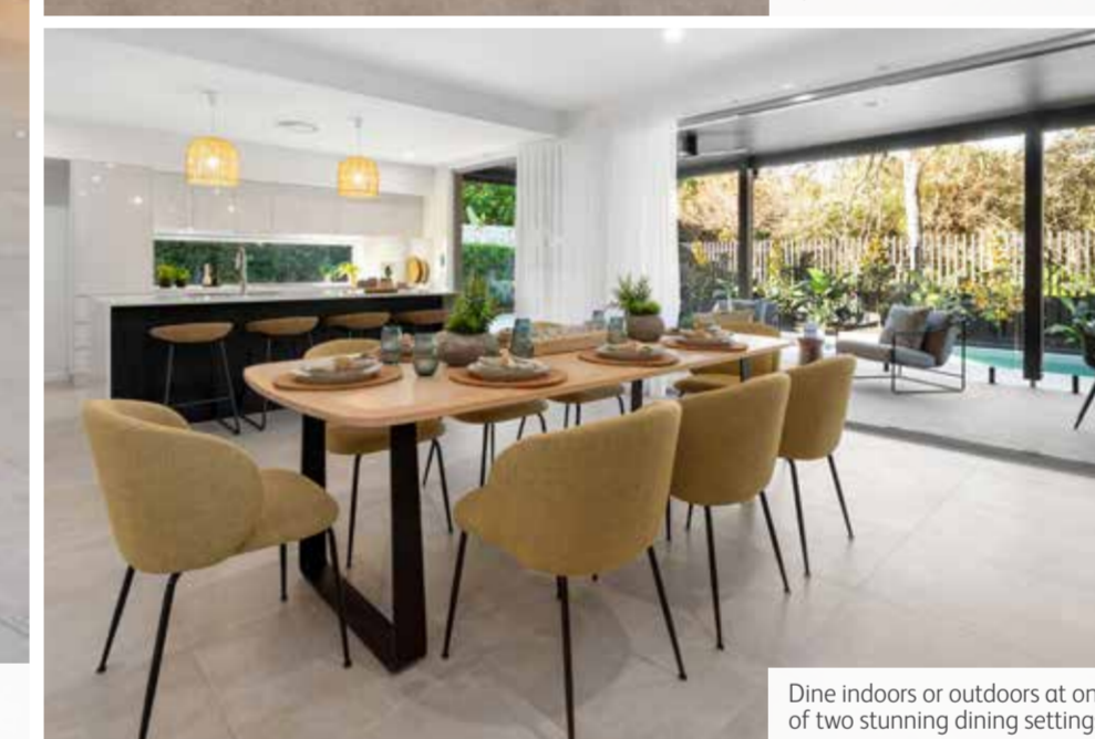
Dine indoors or outdoors at one of two stunning dining settings