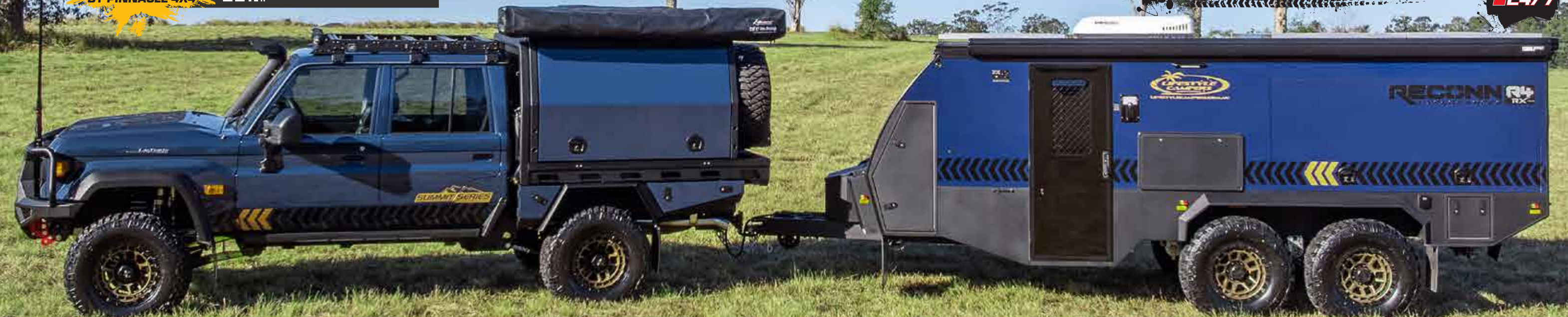
CUSTOM TOYOTA MILITARY GXL (LANDCRUISER 79 SERIES)