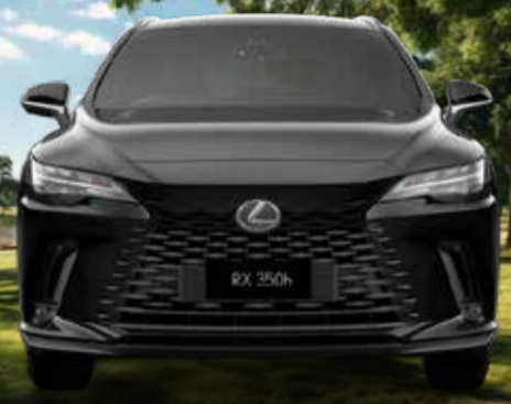
LEXUS RX350H 2WD