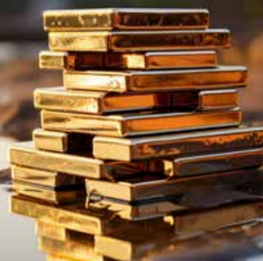
$100K GOLD BULLION