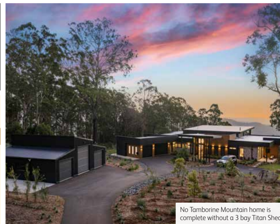
No Tamborine Mountain home is complete without a 3 bay Titan Shed

Estimated rental return: Furnished: $156,000 p/annum Unfurnished: $130,000 p/annum