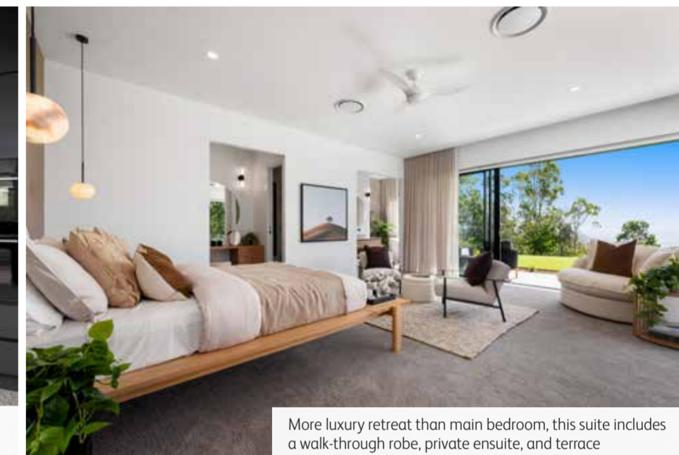
More luxury retreat than main bedroom, this suite includes a walk-through robe, private ensuite, and terrace