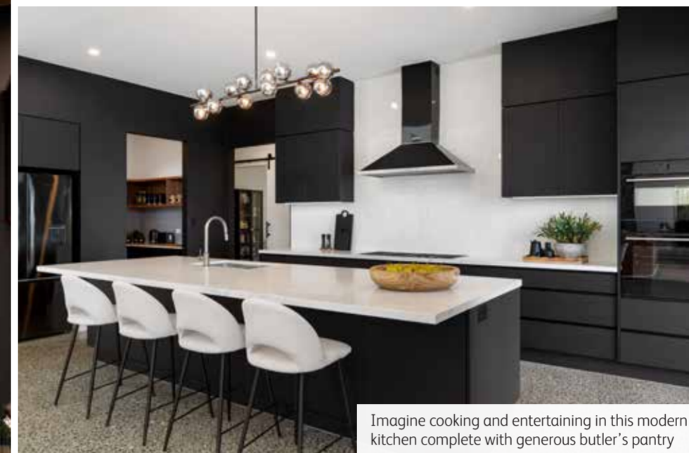
Imagine cooking and entertaining in this modern kitchen complete with generous butler's pantry