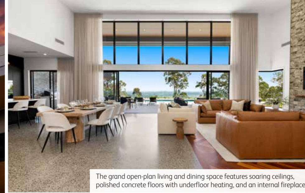
The grand open-plan living and dining space features soaring ceilings, polished concrete floors with underfloor heating, and an internal fireplace