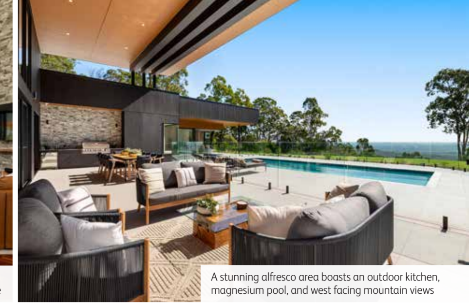
A stunning alfresco area boasts an outdoor kitchen, magnesium pool, and west facing mountain views